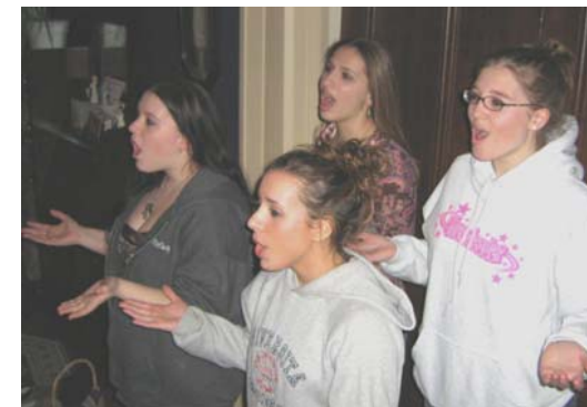
Amadeus Chorale Summer Faculty

All participants in the Amadeus Chorale Children’s Music Camp are enrolled through the Amadeus Chorale, Inc. The Amadeus Chorale is a choral program for young singers in Genesee, Orleans, Monroe and Livingston Counties. The Amadeus singing season runs from September through May, producing several major concerts throughout the year. Singers also perform at the Lilac Festival, at a home Redwings Game, with local symphonies, and for visiting dignitaries. Singers from the Amadeus Chorale have sung on Peter Jennings World News Tonight , in Independence Hall, in the National Cathedral, and on four CDs. Amadeus is a great place to learn new music skills!